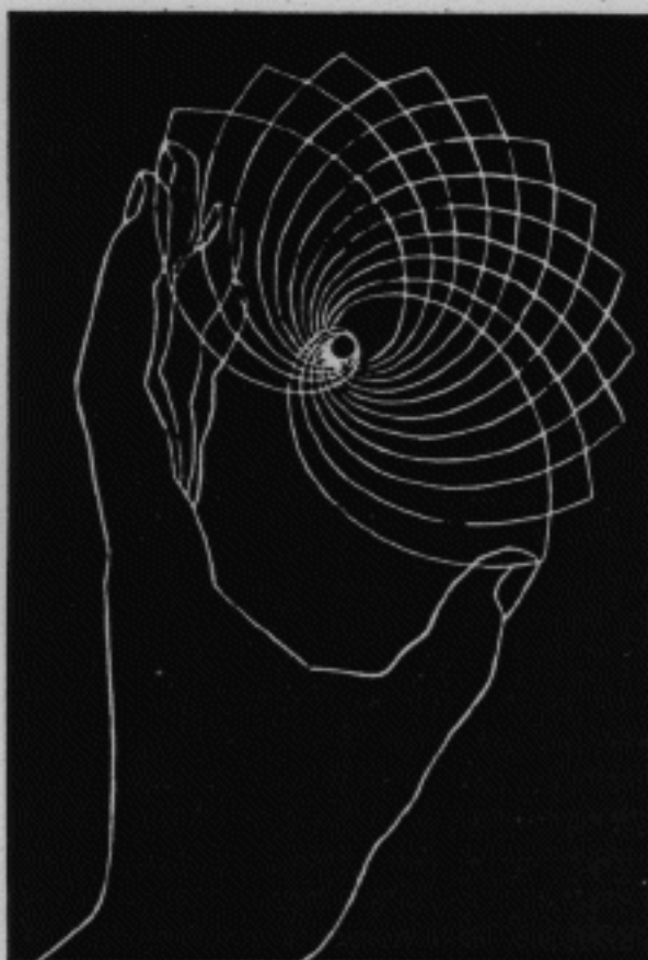
As a hand opens from a fist, it creates logarithmic spirals with its fingers.