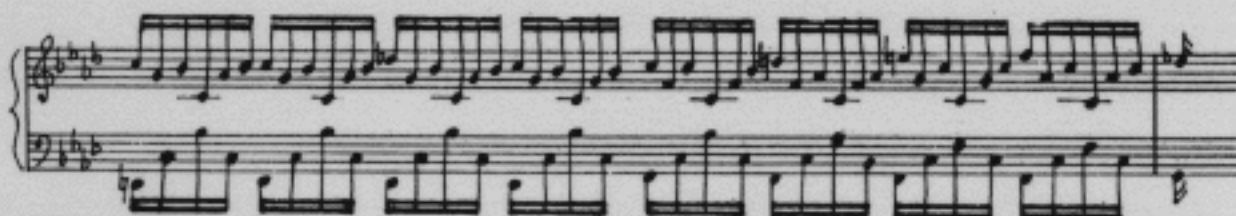
A passage from Chopin's Etudes op. 25, no. 1 demonstrates a symmetrical path visually and melodically.